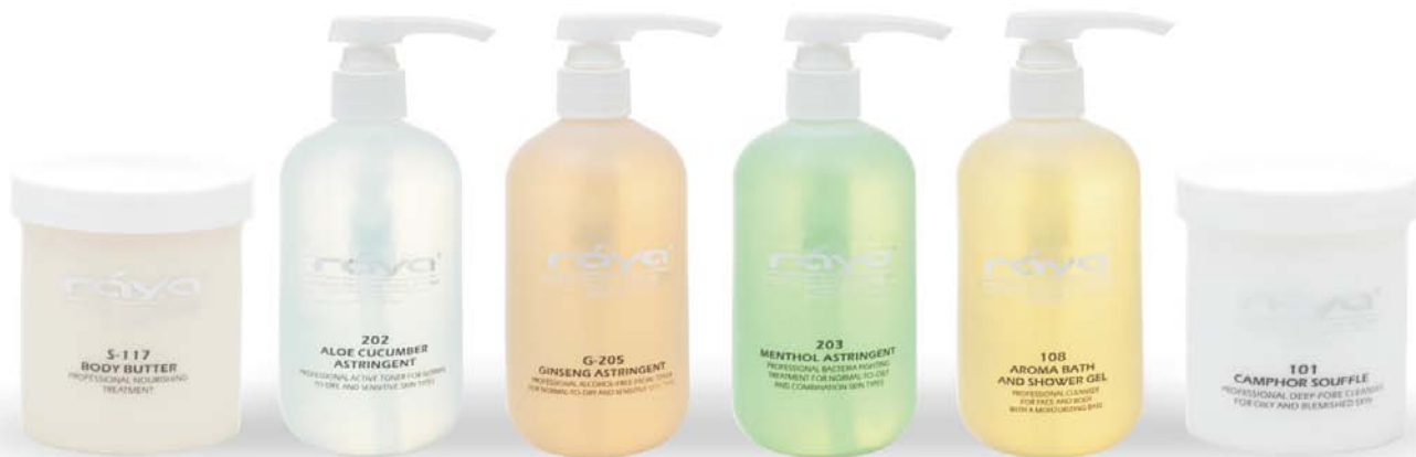
Back Bar Sizes For Convenience And Economy